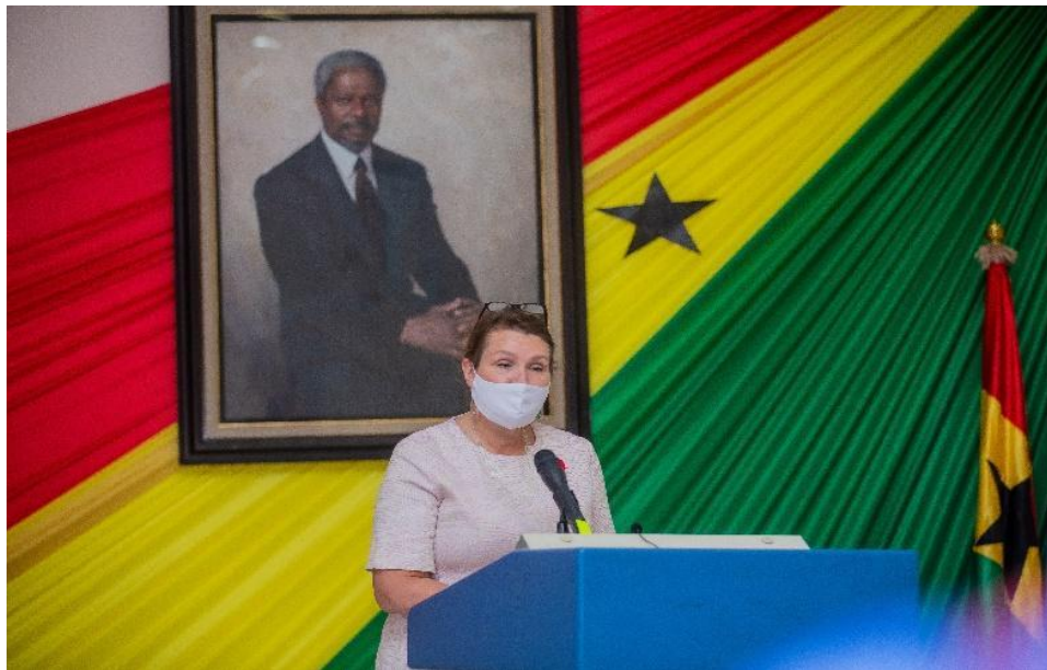
H.E. Kati Csaba, Canadian High Commissioner to Ghana

The conference was initiated by a series of addresses and goodwill messages from the special guests and dignitaries, who underscored their unflinching support to GoGMI and WISTA for their contributions towards enhancing an "all-inclusive" blue economy trajectory in Ghana.