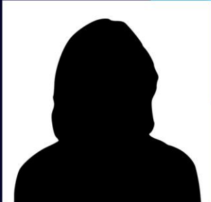
Hon Kati Csaba Canadian High Commissioner to Ghana