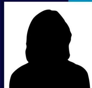
Hon. Kathleen Ayensu Quartey African Union, Special Rapporteur on Piracy and Maritime Security